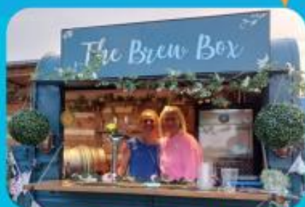
THE BREW BOX +COCKTAIL BAR