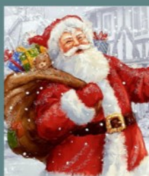
SANTA SLOTS ARE FOR ST MARY'S CHILDREN & SIBLINGS ONLY